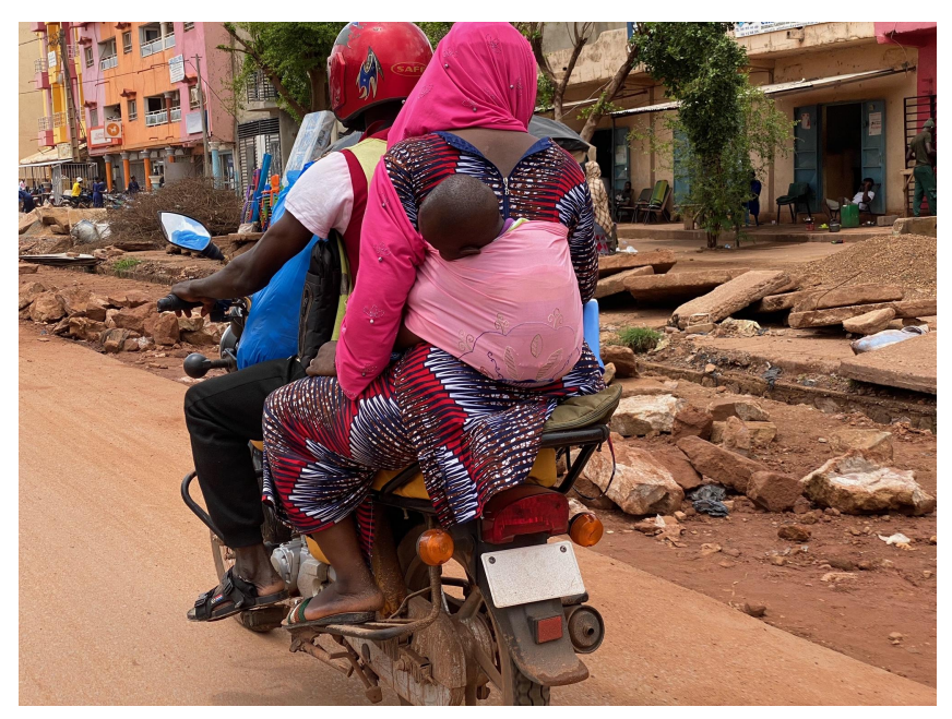
Picture: A mototaxi in Bamako. Read the blog series about motor taxis in Bamako, here.

Research themes included motor taxis in Bamako, conceptualisation of 'youth' by different actors, school activities in winter in San, goldmining, and unemployment of the youth.