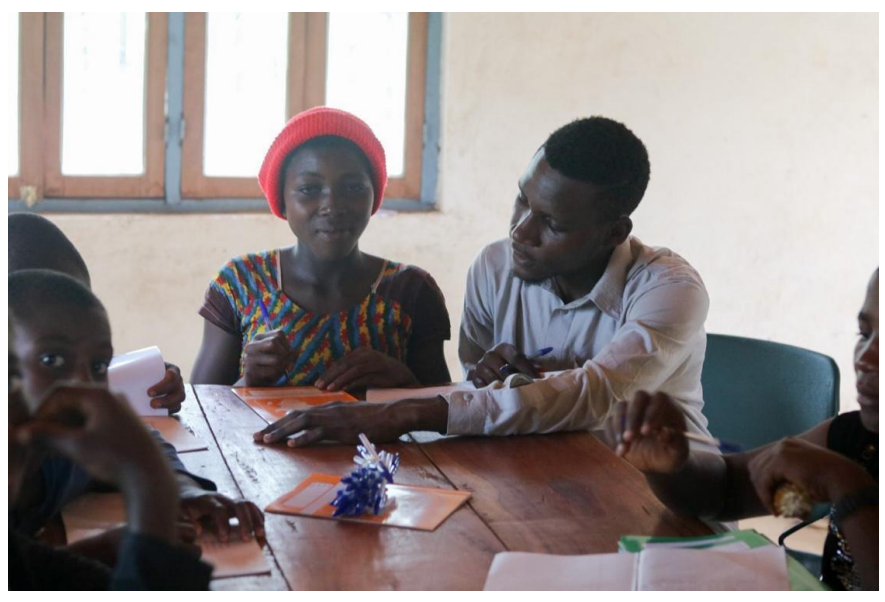
Baba, northwest Cameroon, 2016. Read his blog 'My stay at the orphanage' here.